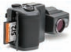
CompactFlash cards were the first small form factor Flash memory cards.